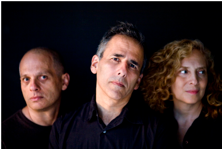
Bang on a Can founding artistic directors David Lang (left), Michael Gordon and Julia Wolfe.

Something possibly worth noting about the influential New York new-music behemoth Bang on a Can is that the name is, strictly speaking, a misnomer. There aren't any cans, and there's only a reasonable amount of banging.